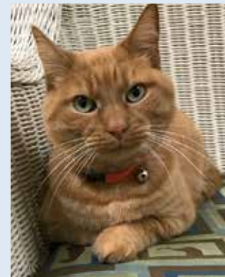
A perineal urethrostomy was performed to allieviate Ike's severe FLUTD, and he feels much better.

Not all male cats (and rarely female cats) will become obstructed. If a male cat becomes blocked, this is an emergency, and needs immediate medical attention. A urinary catheter will be inserted while under sedation to remove the obstruction and will remain there until the bladder begins to heal. Some