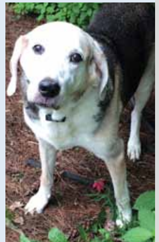
Fox, after treatment

Our patients cannot tell us their source of their pain or illnesses, but the use of ultrasound enables us to better determine a proper diagnosis and treatment plan. Fox's health and outcome were greatly affected for the better with the use of ultrasound, and, for that, we are all grateful.